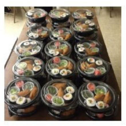
$12.00 per plate

Available for pick-up between 12 noon and 1:30 pm on Sunday, May 18<sup>th</sup>. All proceeds to benefit the Buddhist Church of Ogden